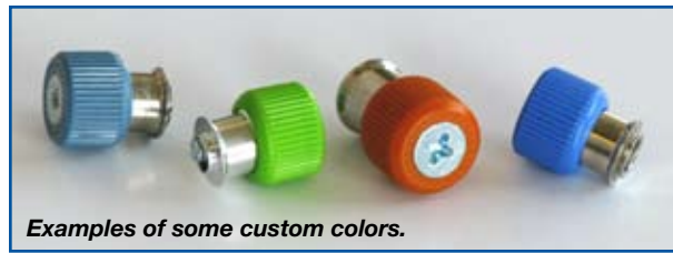
Examples of some custom colors.

PEM C.A.P.S. captive screws can be developed for exact color matching. The colors provide the capability to designate service access levels for equipment, color-reference operating and/or maintenance instructions, or conform to end-use aesthetic requirements.